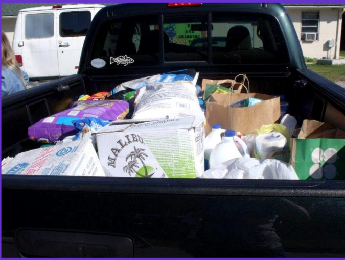
BR's truck was loaded with supplies for the shelter....no we did not give the dogs Malibu Rum, it was just a box, honest!